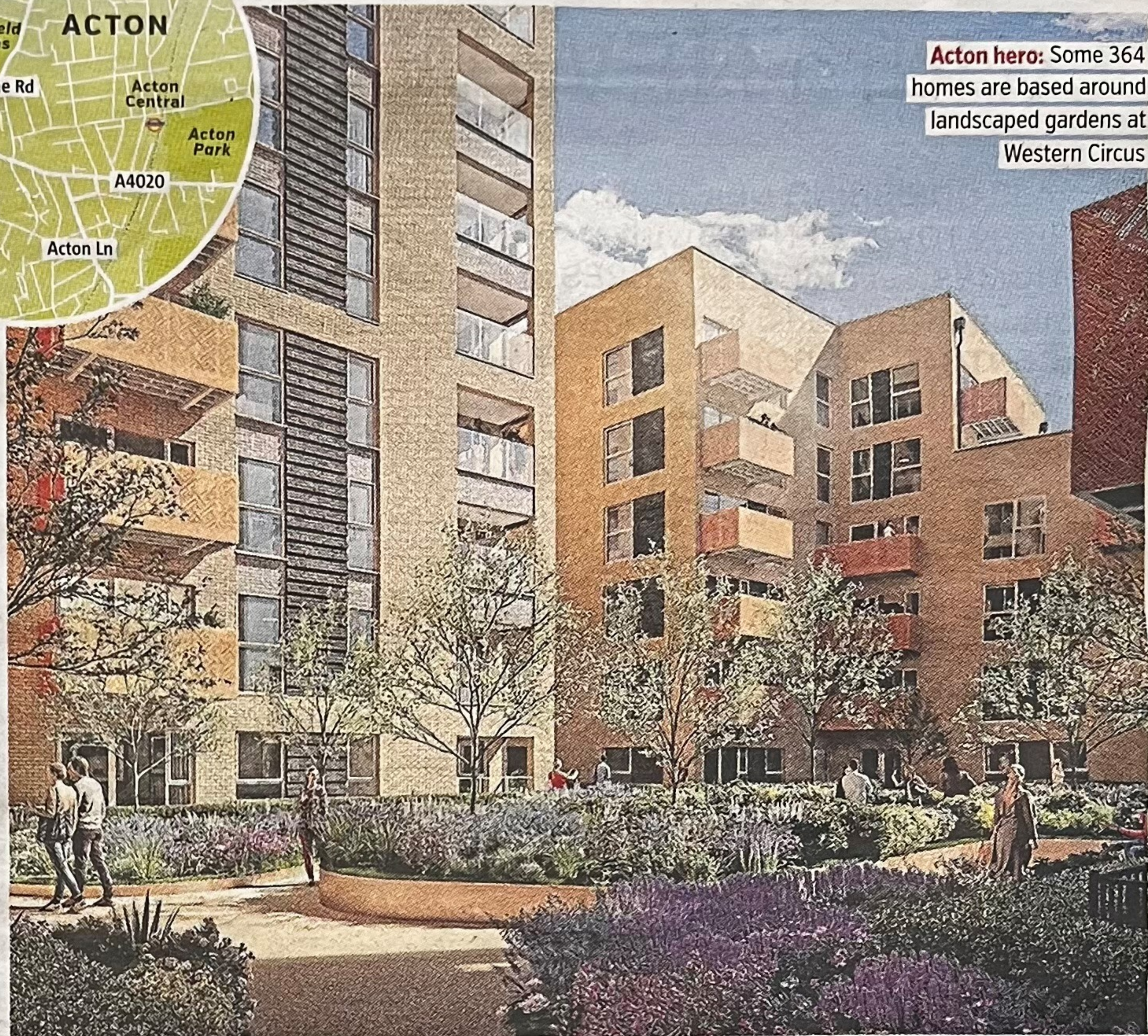
Acton hero: Some 364 homes are based around landscaped gardens at Western Circus