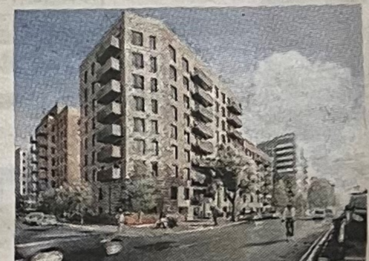
Balconies: Acton Gardens' outside space

TOP RUNG £3MILLION An impressive double-fronted detached house with six bedrooms, three reception rooms, three bathrooms, a west-facing garden and off-street parking. kfh.co.uk