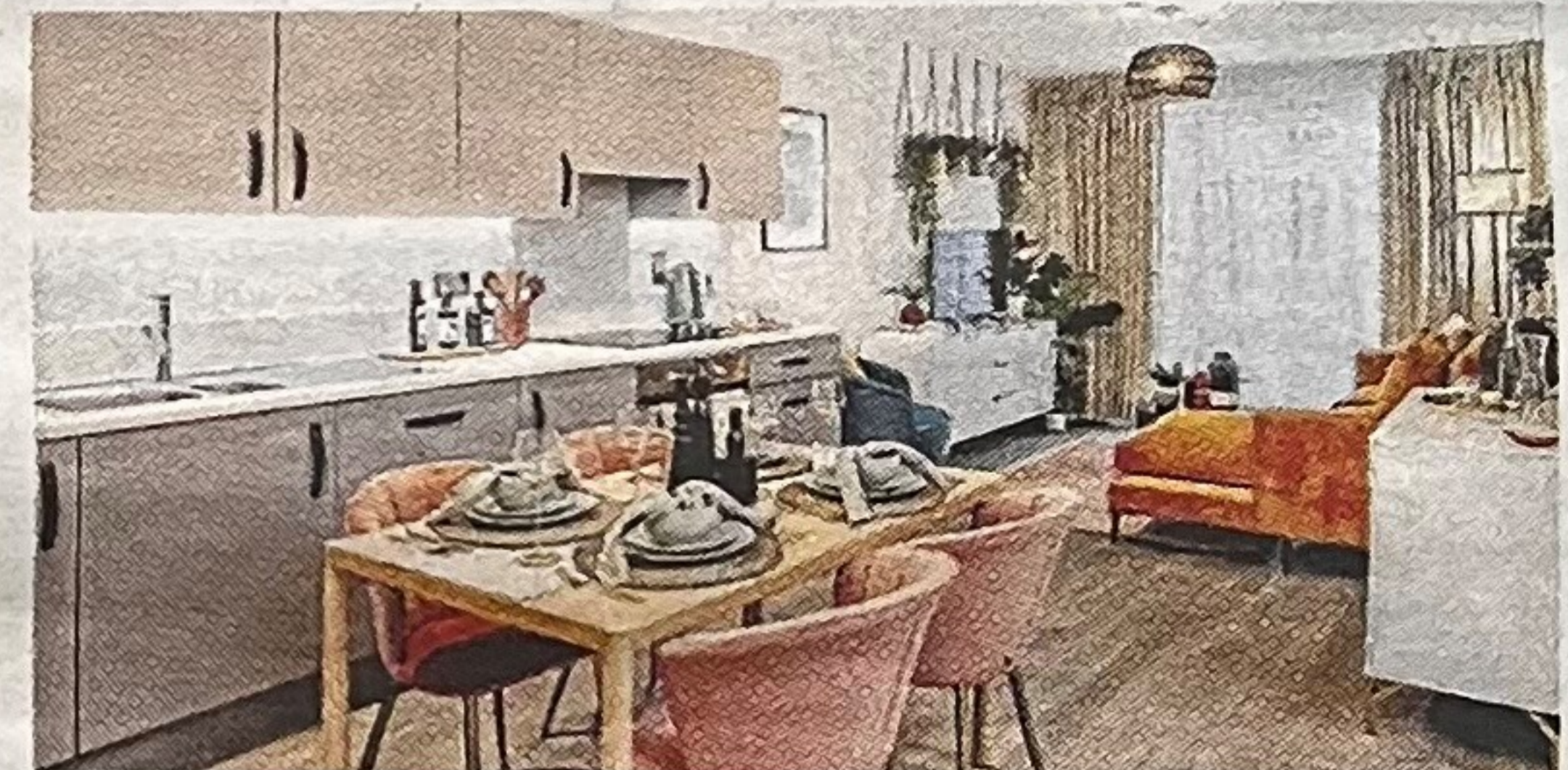
Go West: The mixed use scheme at One West Point

A five-minute walk from East Acton station, Barratt London's Western Circus , consists of 364 apartments arranged around landscaped gardens, with cycle storage and car club membership. It's now over 90 per cent sold and the remaining one and two-bed homes are from £427,000. Help to Buy's available and they'll be